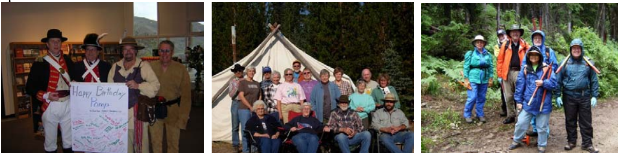
Jean Baptiste Charbonneau's 200 birthday; Lolo Trail work party group shot; Workers on the trail – come rain or shine!