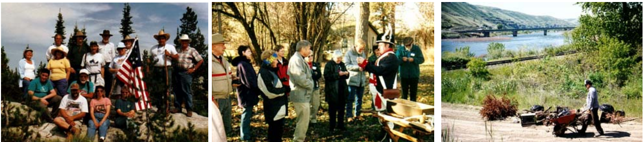
Hiking Sherman Peak in 1998; Meeting Sergeant Gass at Lewis and Clark Trail State Park in 2001; Cleanup at Arrow Junction in 2002