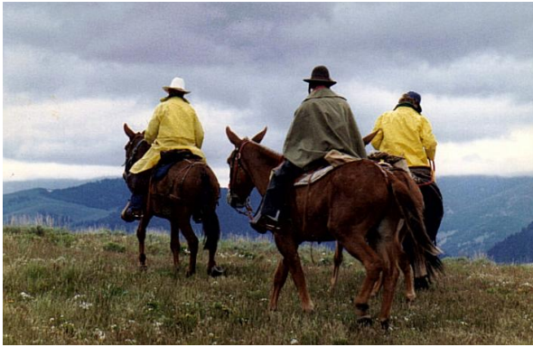
The Backcountry Horsemen provided a trail ride.