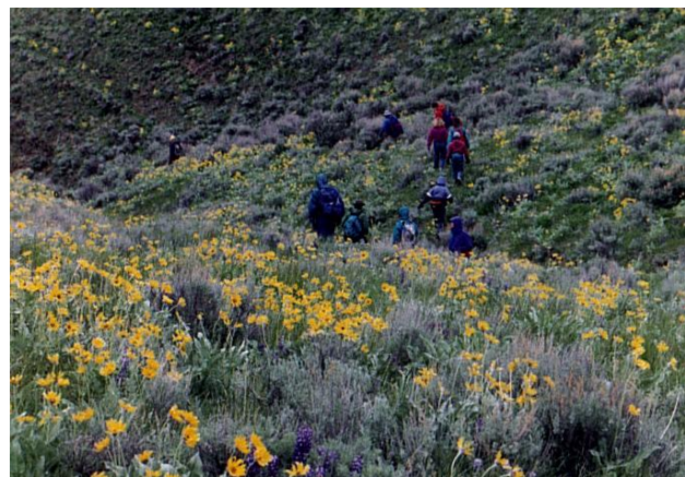
One group hiked through the Bitterroot Mountain foothills through the Arrow-Leaf Balsam Root