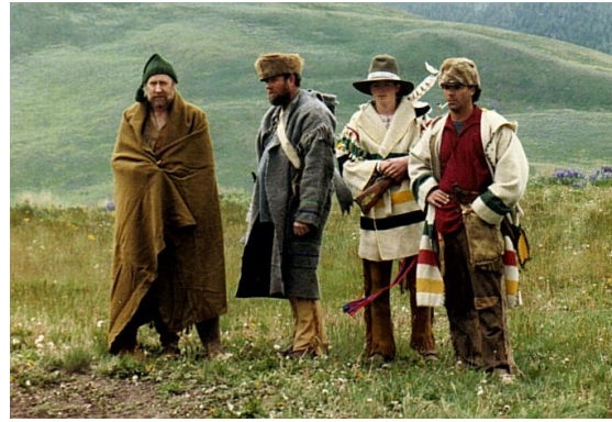
Local re-enactors added color to the day.